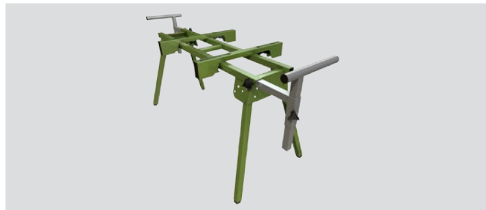
BELT CUTTER STAND